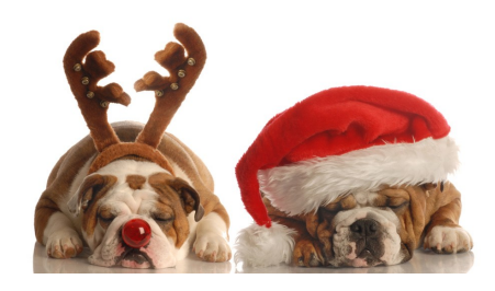
Don't forget your pets this holiday!