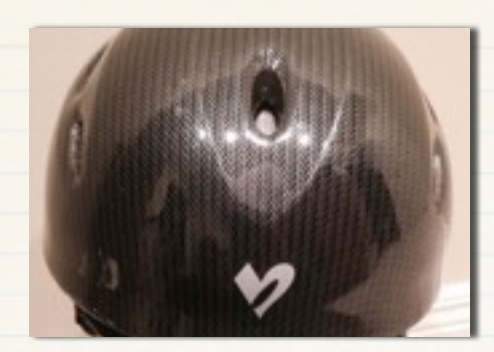
Boeri helmet, Small, Black and silver herringbone design.