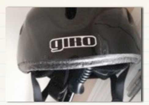
Giro helmet, Small, Solid black, padded helmet bag included.