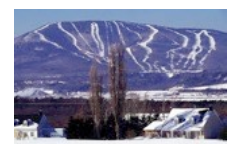
Mt. St. Anne