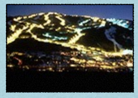
Dercum Mountain (Front Side)

http://lexskisports.org/2015-keystone-trip