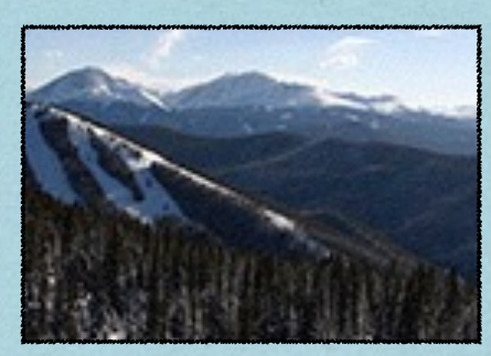
The North Peak