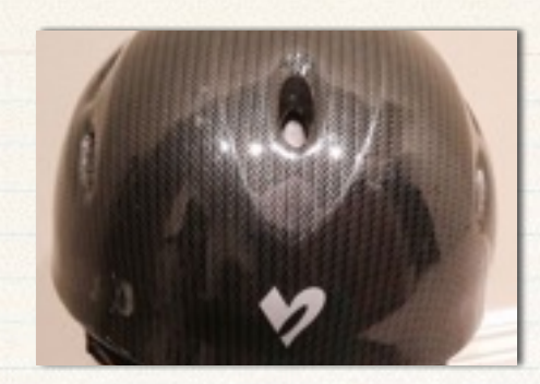
Boeri helmet, Small, Black and silver herringbone design.