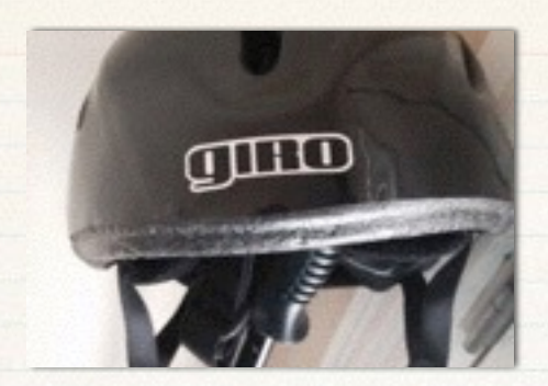
Giro helmet, Small, Solid black, padded helmet bag included.