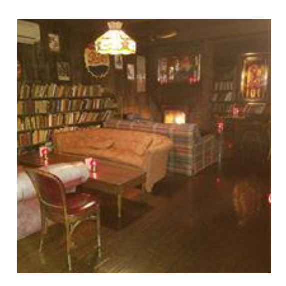
816 East Euclid Avenue Lexington, KY 40502