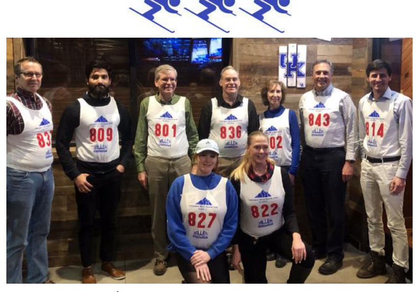
The 2019 LSSC Racing Team