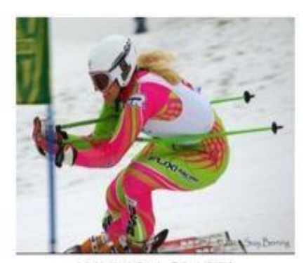
HAVING A BLAST!