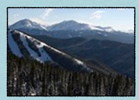
The North Peak