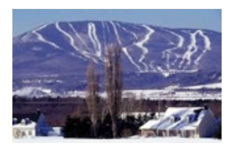
Mt. St. Anne