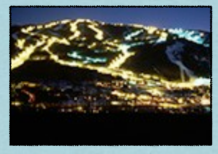
Dercum Mountain (Front Side)

<u>Payments</u>: Aug. $100; Sept. $275; Oct. $275; Nov. $275; Dec. $170. To make your deposit payment, click here: http://lexskisports.org/2015-keystone-trip