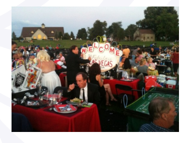
Award-wining tables, fun, feathers, friends and the "Rat Pack" . . . What more do you need?