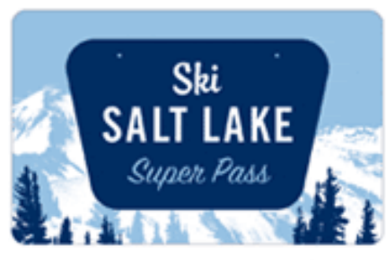
ALTA - BRIGHTON - SNOWBIRD - SOLITUDE

The trip leader is Dan Geiger at dan.geiger@insightbb.com or 859.797.4212.