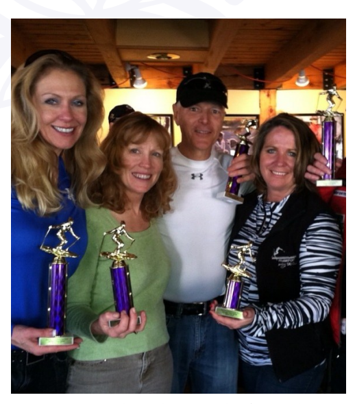
OVSC racers show the rewards of a good race.