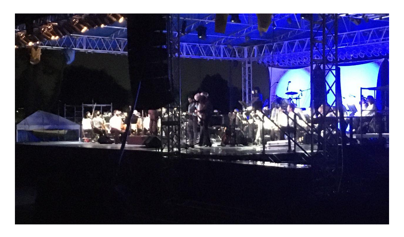
2021 theme was Revolution: The Music of The Beatles.

On August 14, eleven intrepid LSSC music lovers braved an evening of rain to hear a great concert of Beatles music at the annual Picnic with the Pops. The weather resulted in a rain delay but the music finally began at 9:00 p.m. and was worth the wait!! The guest musicians, supported by the Lexington Philharmonic, provided a convincing medley of Beatle favorites.